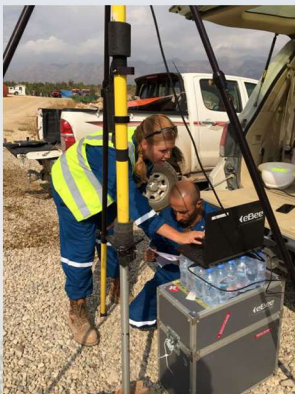
Northwind's UAV operators upload freshly-captured data

Robotic Total Station (more cost effective & accurate than standard total station)