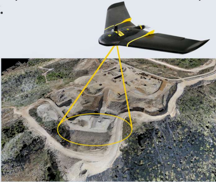
The image above is not a photograph, but a 3D rendering comprised of millions of data points from our drone surveying system.

RVFLimited has performed extensive UAV surveys internationally and is authorized to export all related equipment.